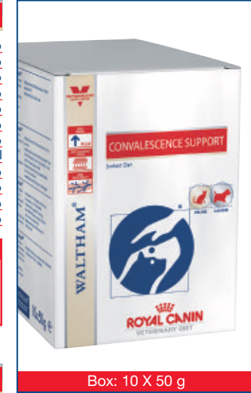
Box: 10 X 50 g

Milk protein, vegetable oils, malt extracts, egg powder, minerals, maltodextrin, vegetable fibres, soya lecithin, taurine, Fructo-Oligo-Saccharides, marigold extract (rich in lutein), lycopene, beta-carotenes.